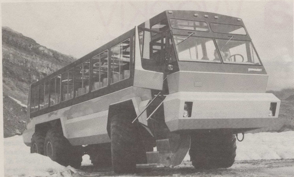
The Terra Bus provides all-terrain mobility to transport up to 56 passengers. Equipped with large, low pressure Terra tires, the bus can be used to transport personnel in on-road/off-road applications.

lowing them to transport heavy equipment, supplies and personnel across the softest terrain conditions.