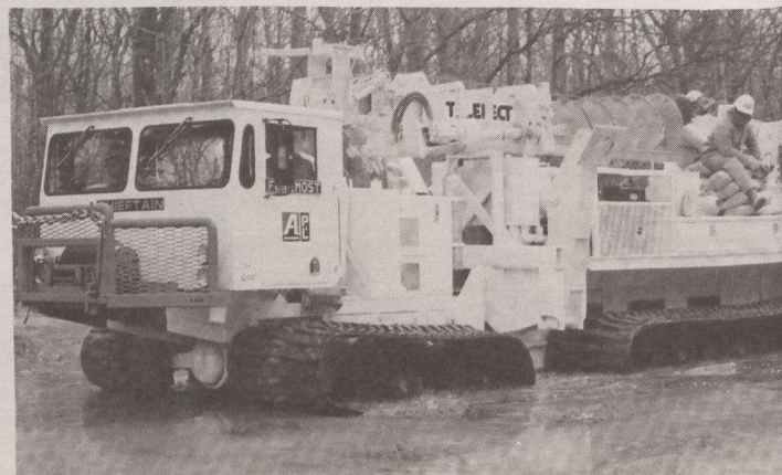
A versatile, four-tracked carrier with articulated steering, the Chieftain, which is used for mounting drills, cranes or backhoes, is widely used in the petroleum, geophysical and utility industries.