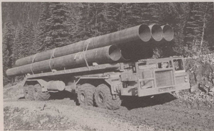
The Magnum, Foremost's largest Terra-tired vehicle is designed to carry loads weighing up to 64 tonnes and can be used effectively in difficult off-road conditions.