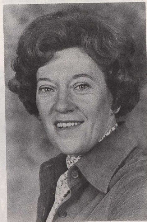
Secretary of State for External Affairs Flora MacDonald

State of Canada and Minister of Communications;