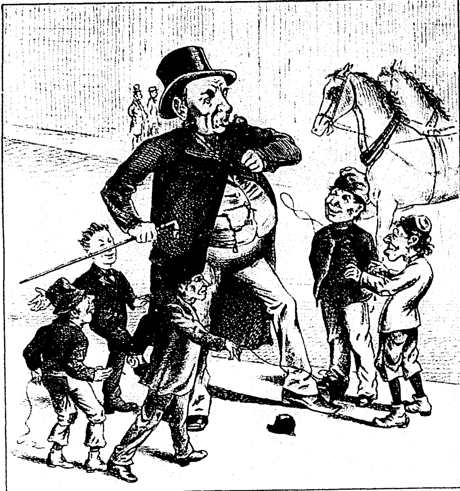
MERRY SPRING HAS COME AGAIN.