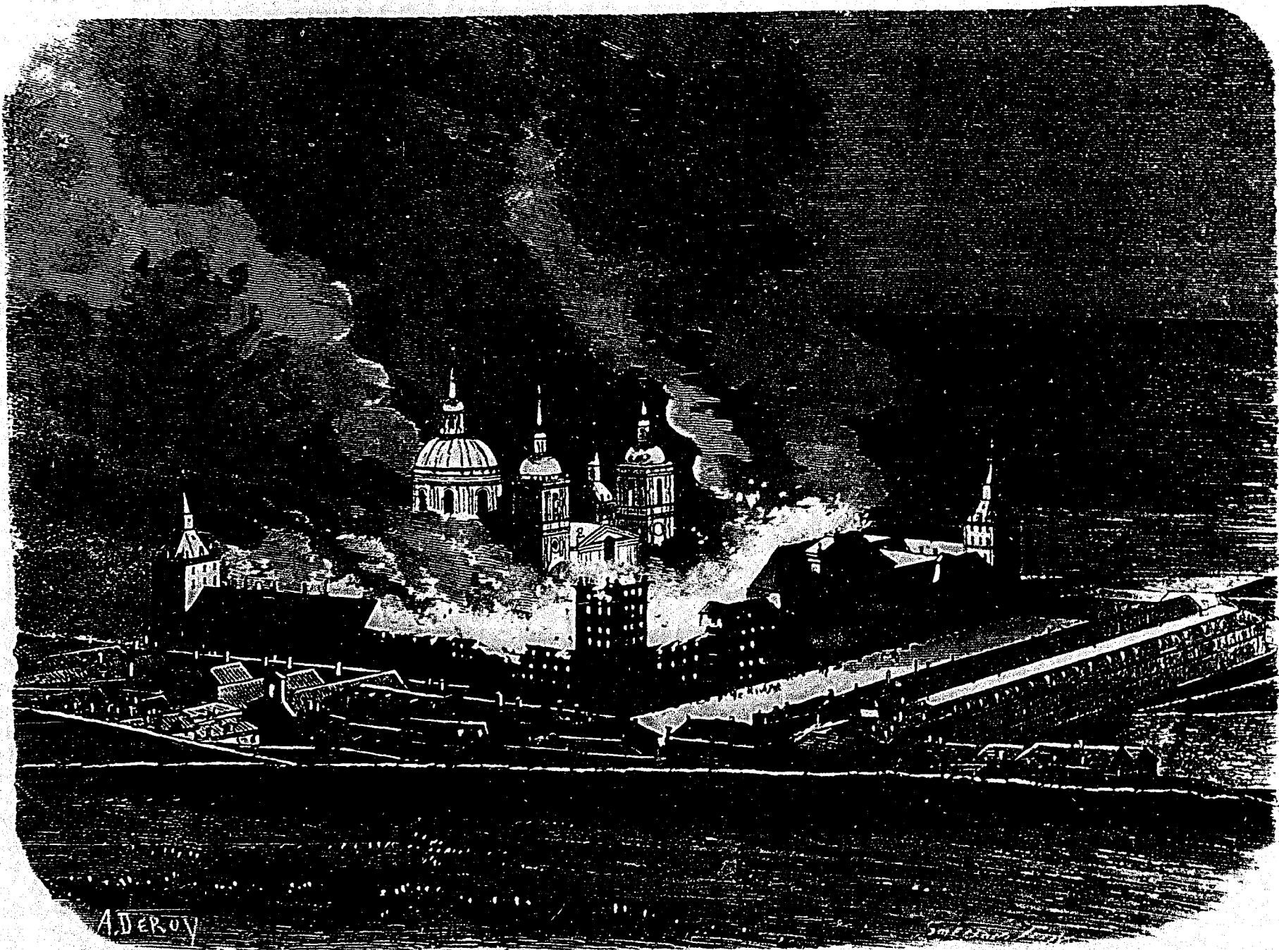
BURNING OF THE ESCURIAL ON THE NIGHT OF THE 2ND OCTOBER.