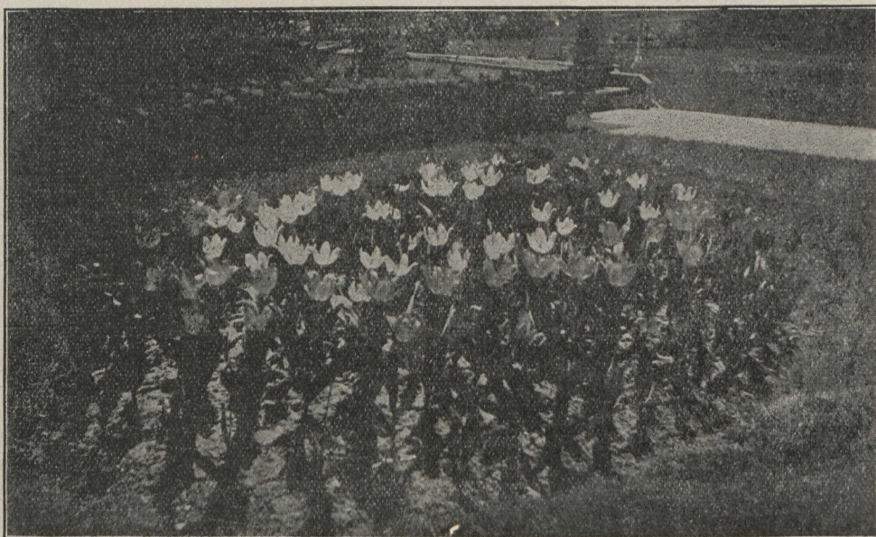
A Tulip Bed Furnishes Almost the First Burst of Bloom in the Springtime

All hardy currants, black, red and white, may be planted in any soil in Saskatchewan where wheat does well. Currants need no special protection or shelter in that province. They respond quickly to good treatment, but stand more neglect than almost any other fruit.