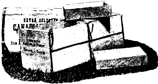
FIG. 1142.—CASES FOR COLD STORAGE PACKING.

tents, thus a case containing eight trays with twelve peaches in each tray, will be marked 8 x 12, or 6 trays of 8 in each, 6 x 8. Nothing but the finest fruit will be allowed to go forward, and thus in time we hope to establish a reputation for Ontario fruits surpassing even that of California.