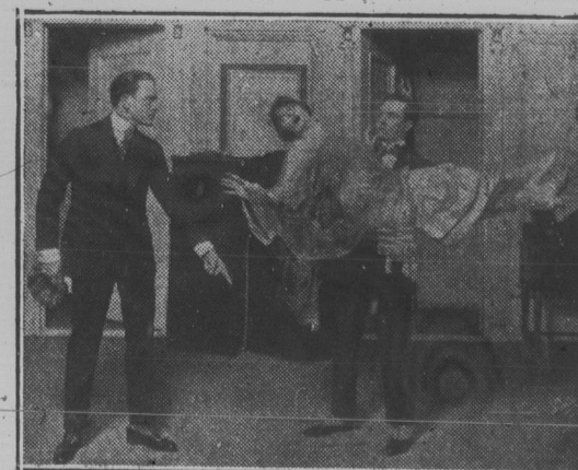
Scene From Act 1