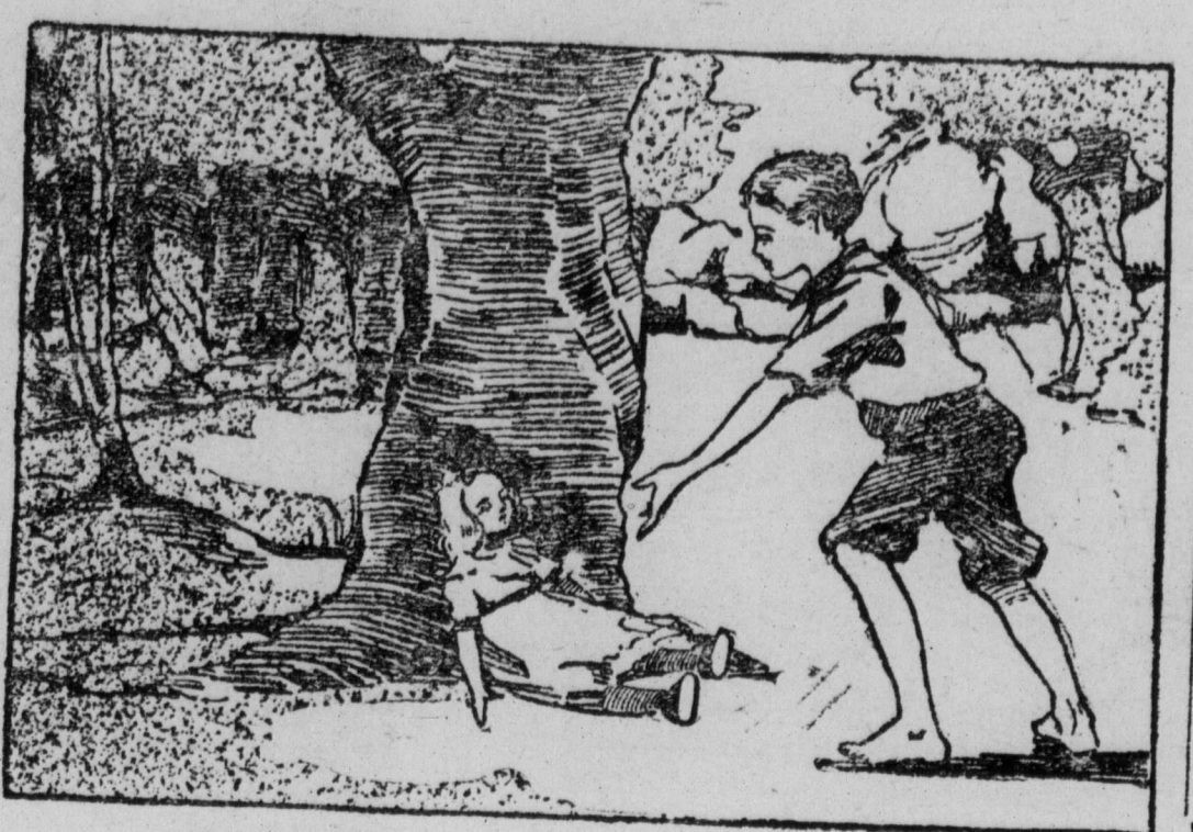
"NEVER WAS THERE SUCH A BEAUTIFUL DOLL"

Therefore the boy gently raised the Doll Fairy in his arms, and holding it carefully, so as not to soil the pretty the flaxen curls and the large blue dress, he bore it to the little girl who