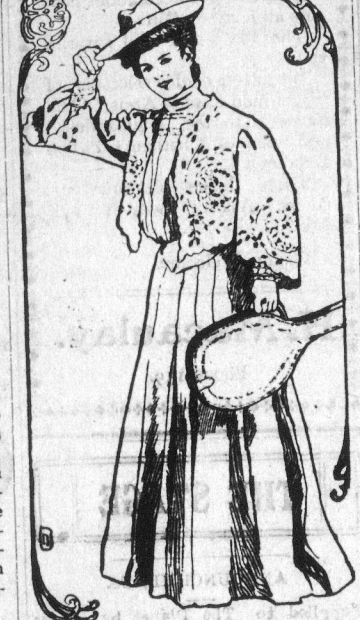
OWN OF LINEN AND EMBROIDERY.