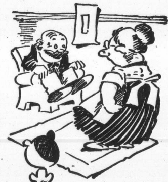
Certainly Well Trained.

The largest sheet of plate glass in existence is to be seen at the British Empire Exhibition. This mammoth window pane had an adventurous journey from Yorkshire to London. Being much too large for carriage by rail—for the sheet measures 14ft. by 24ft.—it had to be transported in an enormous lorry towed by a steam tractor. A special route had to be mapped out for the journey, and many detours were necessary to avoid bridges too low for the giant crate in which the glass was packed. The area of this immense pane is 336 square feet, and the handling of so large a sheet of glass at Wembley was no light task, in spite of the fact that special apparatus had been installed for the purpose. At the works the problem was solved by means of conveyors, equipped with huge suckers resembling the tentacles of a giant octopus. A voice from an unseen presence close beside me said solemnly: "One who is good because he fears to be bad is not good at all."—Sifted Through. Man's boldness and woman's caution make an excellent business arrangement.—Elbert Hubbard.