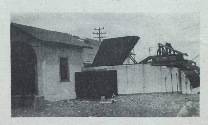
Equipment in use at the Nova Scotia Steel & Coal Company's Mine.