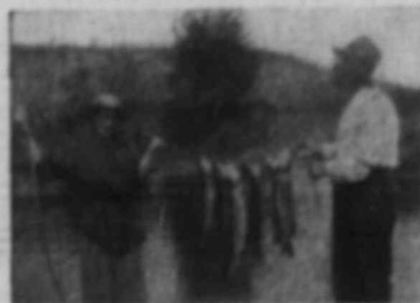
A Good Morning's Catch

While the far-away look is upon us, and we are thinking of the days of sunshine at Gimli, let us tie off to the swimming bath where the youngsters are having a good scrubbing under the care of the deaconesses and their help-