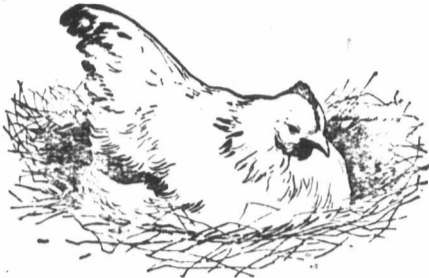
THE SETTING HEN—Her failures have discouraged many a poultry raiser.

You can make money raising chicks in the right way—lots of it.