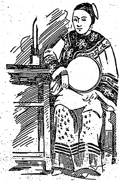
CHINESE BRIDE IN WEDDING DRESS.

the curtain is drawn and the happy couple are supposed to sit and think, not even speak or exchange glances, until preparations for the service are completed. Everything being ready, the groom re-crowns the bride and they walk to the reception room. The whole end of a Chinese reception room is open. In this room, facing the open end, looking into the open court, the couple worship heaven and earth by bowing their faces to the ground four times. They then face in the opposite direction and worship the groom's ancestors in like manner. They next worship each other, and then retire again to the chamber, where the bride's