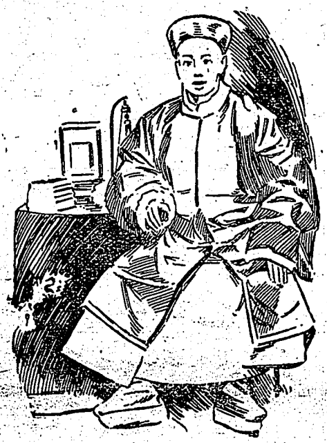
THE CHINESE BRIDEGROOM.