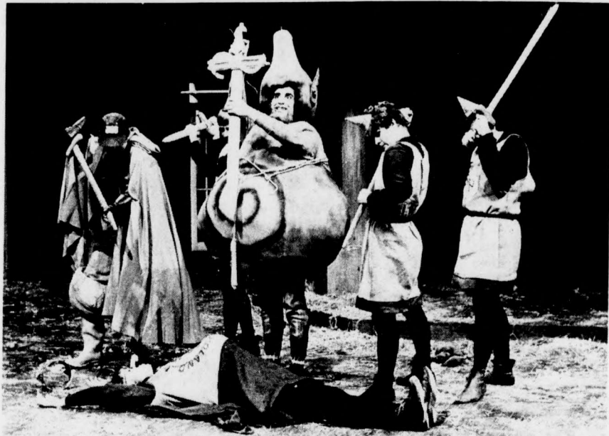
Ubu Roi, the YUP's only failure is well described by the English translation - the King Shit.