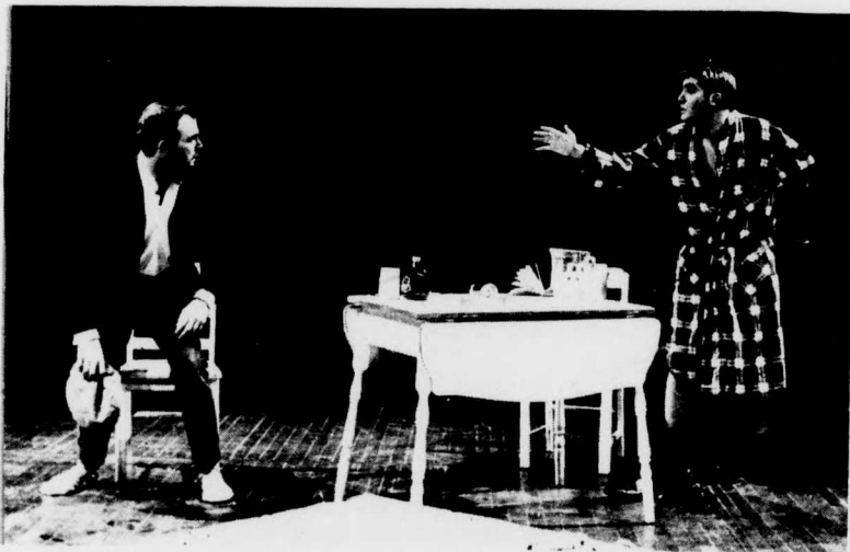
O'Casey's Bedtime Story was one of the features of a successful evening of one act plays which included Pinter's The Lover, Pirandello's I'm Dreaming But Am I?