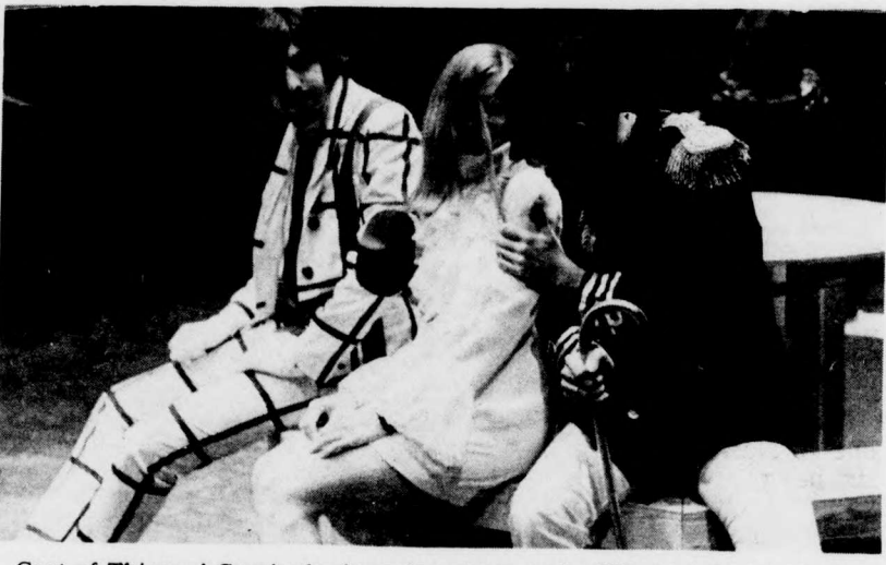
Cast of Thieves' Carnival rehearsing strenuously. Thieves' Carnival plays tonight Saturday, and Sunday.