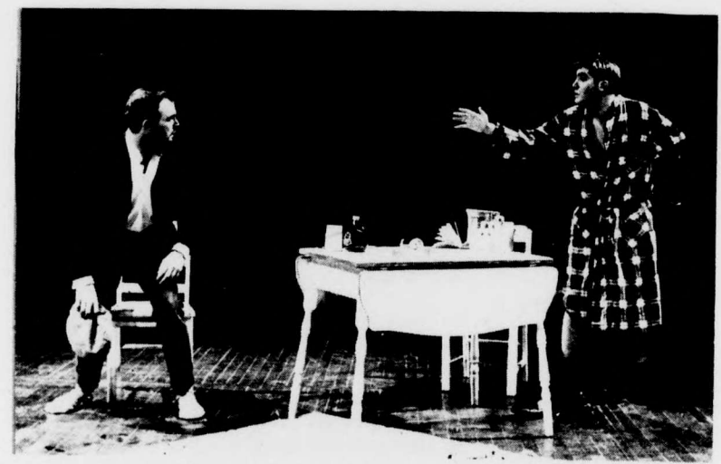
O'Casey's Bedtime Story was one of the features of a successful evening of one act plays which included Pinter's The Lover, Pirandello's I'm Dreaming But Am I?