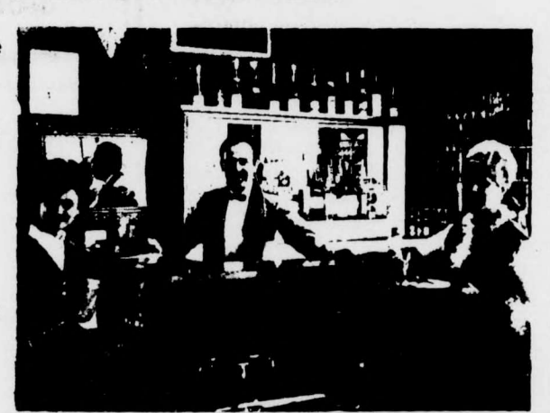
Available for Banquets