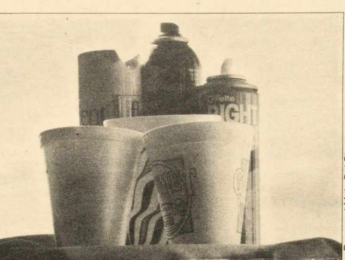
Styrofoam and aerosols damaging ozone, Dal action group says.

Deevey says the student council are "all for" a campus society to monitor the use of styrofoam. The group hopes to qualify for Continued on page 4