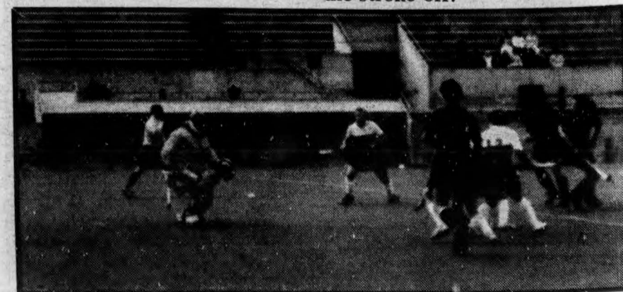
The Redsticks attack

The tournament ended when University of Victoria beat U of T 1 - 0 in the final after UVIC advanced by tying UBC (0 - 0), and winning in the stroke off.