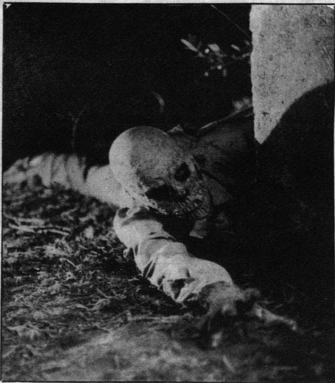
Slash films produce endless bodies that refuse to die. Above body from Return of the Living Dead.