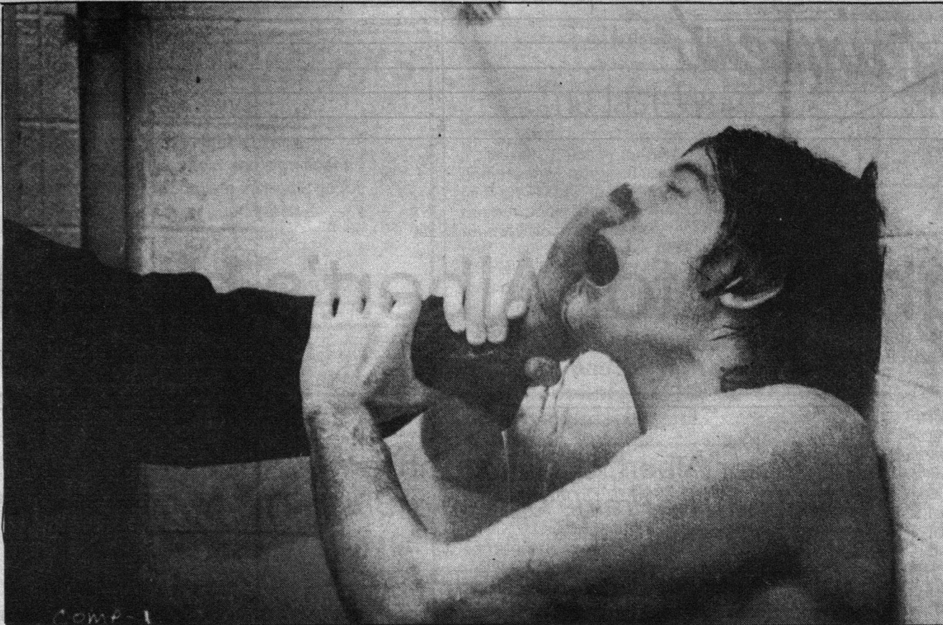
Death in the shower. A staple of slash films. Above photo from one of the never-ending Friday the 13th series.