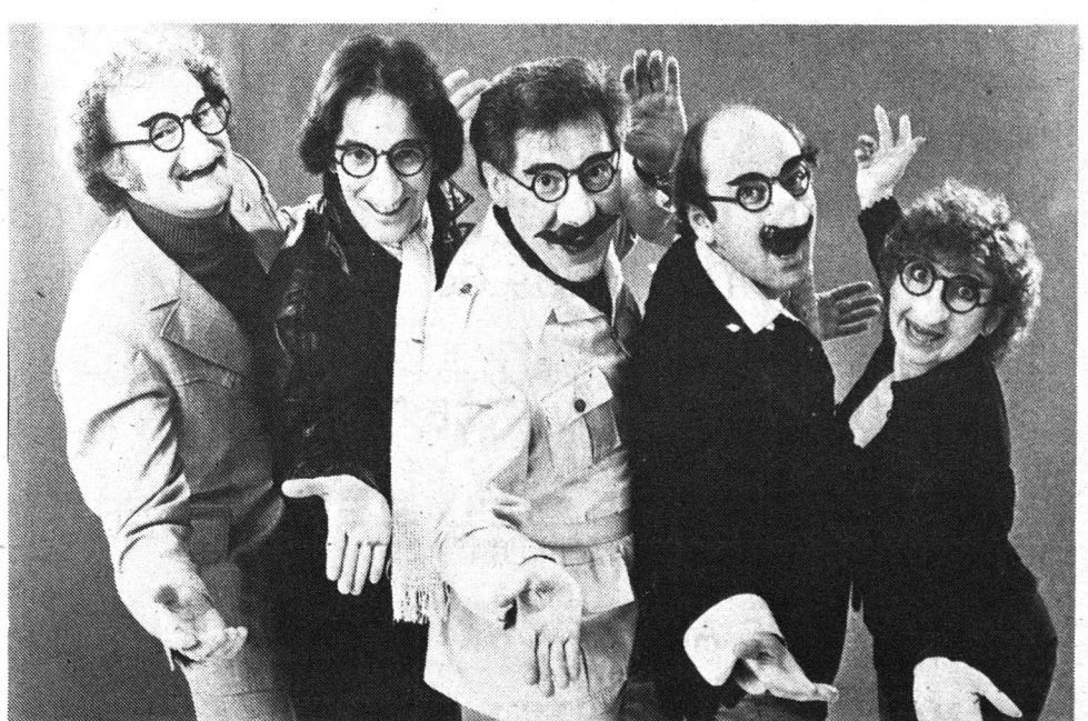
The new Students' Union executive? The Nose family? Five middle-aged farts? A pack of cards?...

Some of the audience complained that the old-age sketch was only token social comment, but the other sketches were also forms of social comment. It was just that they were subtle and hence more socially acceptable.