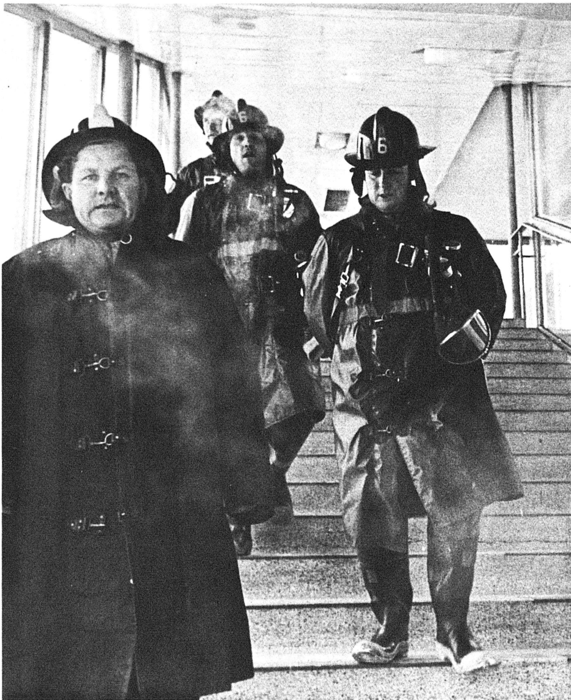
FATIGUED AND DISAPPOINTED —Our loyal defenders of property have rallied to yet another false alarm. The antipyroamniac forces were called when an apparent gas leak was discovered in the basement of the Chem Building. There was no gas leak. A bottle of harmless mercaptan (odourizing agent in commercial natural gas) had shattered, leaving an odour of gas.