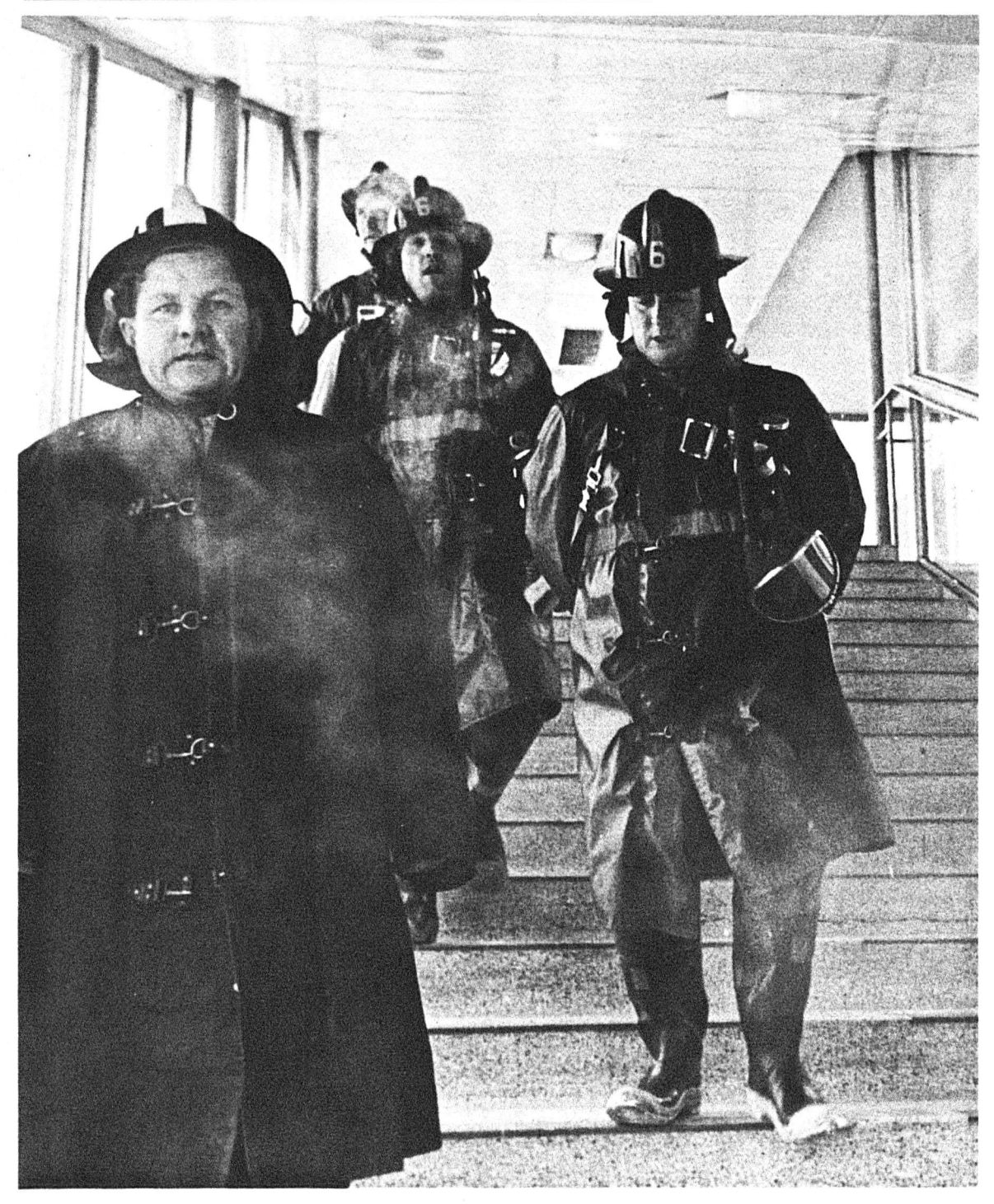
FATIGUED AND DISAPPOINTED—Our loyal defenders of property have rallied to yet another false alarm. The antipyroamniac forces were called when an apparent gas leak was discovered in the basement of the Chem Building. There was no gas leak. A bottle of harmless mercaptan (odourizing agent in commercial natural gas) had shattered, leaving an odour of gas.