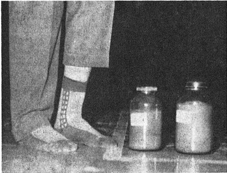
CAMPUS DANCES . . . BIGGER AND BETTER SMELLS