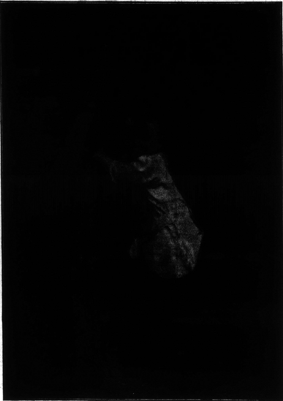
Ready for the Camera

With the delicate adjustments which the relations to grandchildren and chil-