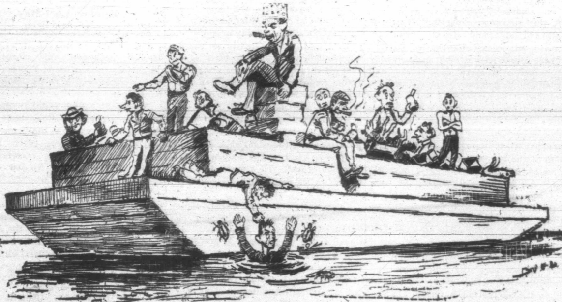
MEETING AT WHICH BOOSTERS' UNION WAS DISSOLVED.