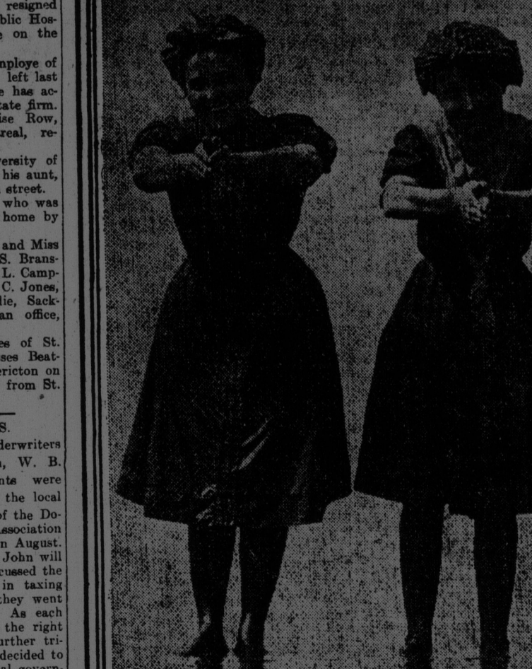
Typical Canadian girls enjoying the water at a bathing beach.