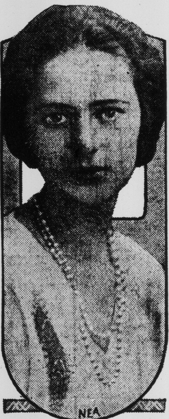
Princess Ileana of Rumania, who is accompanying her mother, Queen Marie, to the United States.