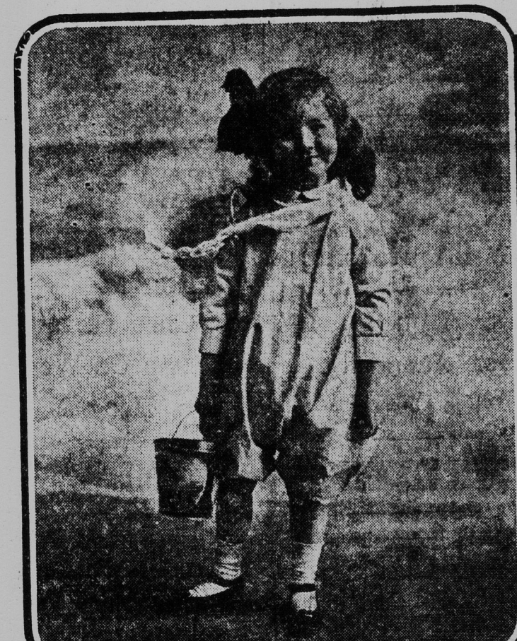
ON THE BEACH IN HER JUMPER.

Very sensible mothers add joy to the playtime hours of their small daughters by dressing them in those very comfortable jumpers of linen or gingham, which are slipped on over the little under waist and panties, thus doing away with any frills or furfulness of dress or petticoats. These little jumpers are made in one piece; that is, the waist and the bloomers are cut in one, and the bloomers are finished at the bottom with a band that buttons around the knees, or is run with elastic. The sleeves are cut comfortably large, though long; this is a protection against the heat of the sun; the neck is finished with a flat, round collar. Sandals, or straw slippers and socks and bare legs, and a dainty sun-bonnet complete this playtime outfit.