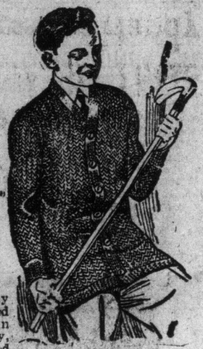
Children's Toques Smart little hockey shapes in flat and honeycomb knit. Plain shades of white, grey, khaki, cardinal and navy; also combinations of two shades of these colors, 50c and 65c.