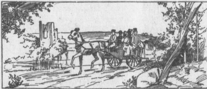
THE IRISH JAUNTING CAR.

muscle in the human body. Indeed, it combines the advantages of horseback riding, walking, and rowing. People who have crossed the Channel in a heavy chopping sea will know what to expect from the jaunting car. Still the tourist in Ireland who fails to employ this mode of travel will make the mistake of his trip.