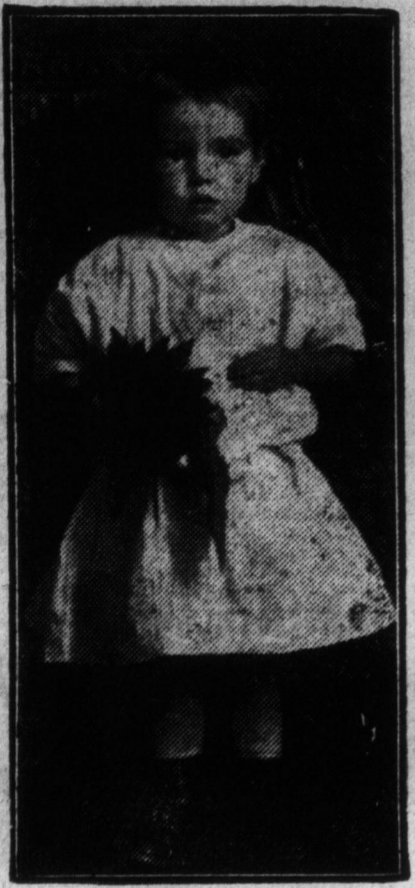
BABY BROOKS of Toronto.