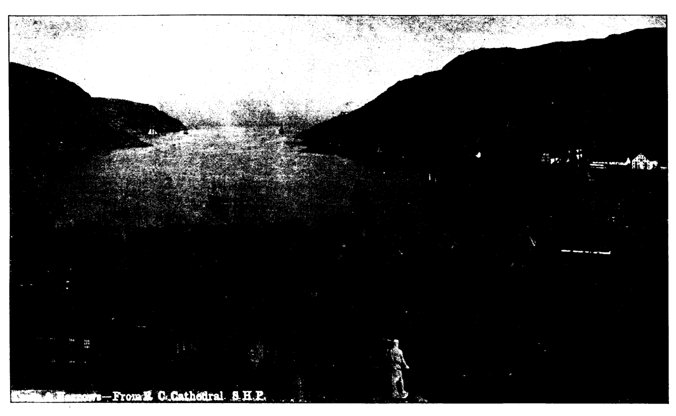
VIEW OF THE TOWN AND HARBOUR OF ST. JOHN'S, NEWFOUNDLAND.