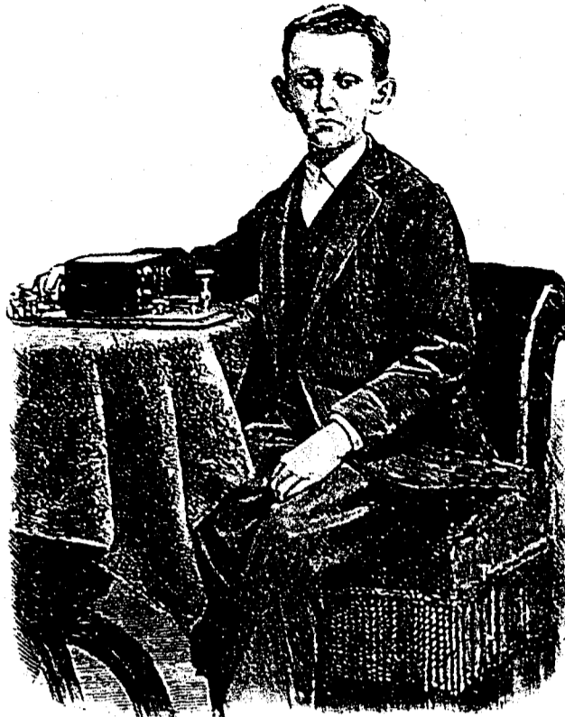
A YOUTHFUL TELEGRAPH OPERATOR