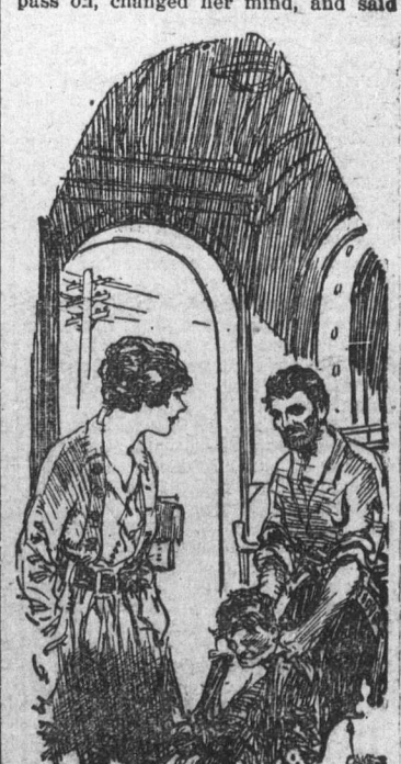
"You Are a Very Courtly Gentleman." very gravely: "You are-a very court-

Again she favored him with that calm, grave, yet vitally interested gandoded appreciatively, made as if to pass on, changed her mind, and said