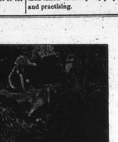
Scene from the new Serial which starts next Thursday April 28th.

The average child at the age of ooklet entitled "What British Edi-seven will learn to play the piano tors Say about Canada," which has easier than at any future time in its just been issued by the Canadian life. This fact has been learned from thousands of cases. The younger the child the more retentive is its mind, the more supple its fingers, hence they will learn while young with The booklet has been issued mainly far less trouble to themselves and for circulation in the Old Country, expense to the parent After the first and readers of this paper may have few lessons are over they start to copies forwarded to any friends in produce simple harmony—become fascinated with music they are proin Canada by sending the names ducing and scarcely any case has and addresses to the Director of been recorded where children have Publicity, Department of Immigra- reached the point where they are tion and Colonization, of Ottawa. No producing but simple melody and charge is made for the booklet or for then failed to really enjoy playing and practising.