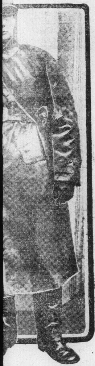
a statesman is over, as some seem to be here shown in a shrapnel-proof helmet for his collection. He has always worn a variety of quaint shapes—in conjunction with the London Daily