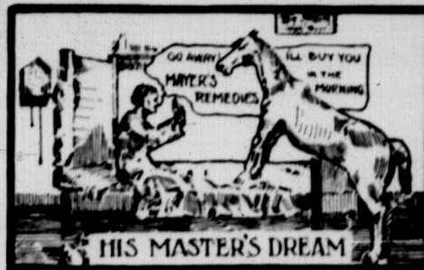
HIS MASTER'S DREAM

Sick or injured stock are not profitable! Make them well. Veterinary's bills are not profitable! Cut them out. Why let animals die when a little prevention will save them? For 30 years in Western Canada I have been healing, curing, saving stock. I can heal, cure, save yours. 20,000 farmers are profiting by using my remedies. Be one of the number. Take advantage now of my newest offer. My New Emergency set, one bottle Colic Cure, one bottle Cough and Fever Mixture, one bottle Barbed Wire Lintiment for $3.99 and with them FREE Wagner's 500 page Farm and Stock Book, worth $2.50 itself. Your great chance to be prepared for all emergencies. Get set and book at once from your dealer, or, if he hasn't got it, send $3.99 at once to me with his name and shipment will be made at once, prepaid. Act on this at once, today. Don't put off. Secure your set and book now.