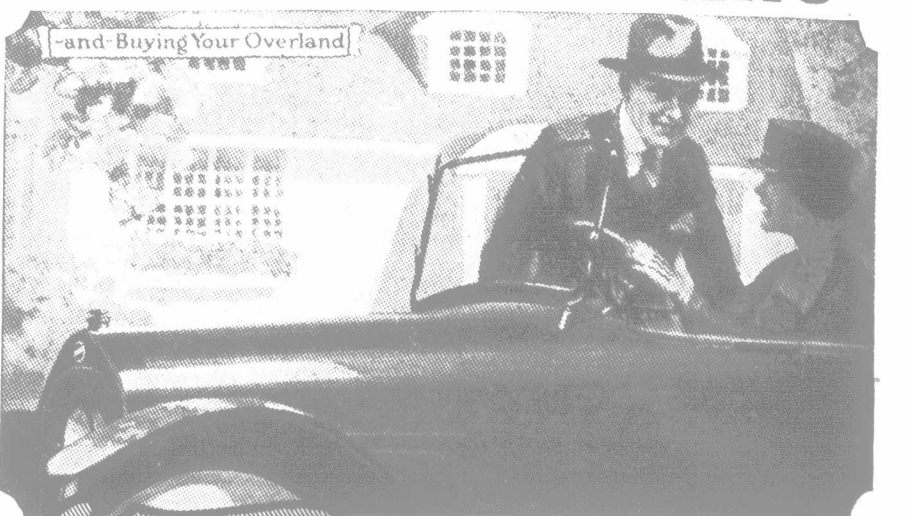
-and Buying Your Overland