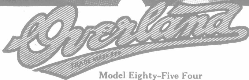
Model Eighty-Five Four

Like the other great events of life, buying the family car is very much the concern of the wife and mother.