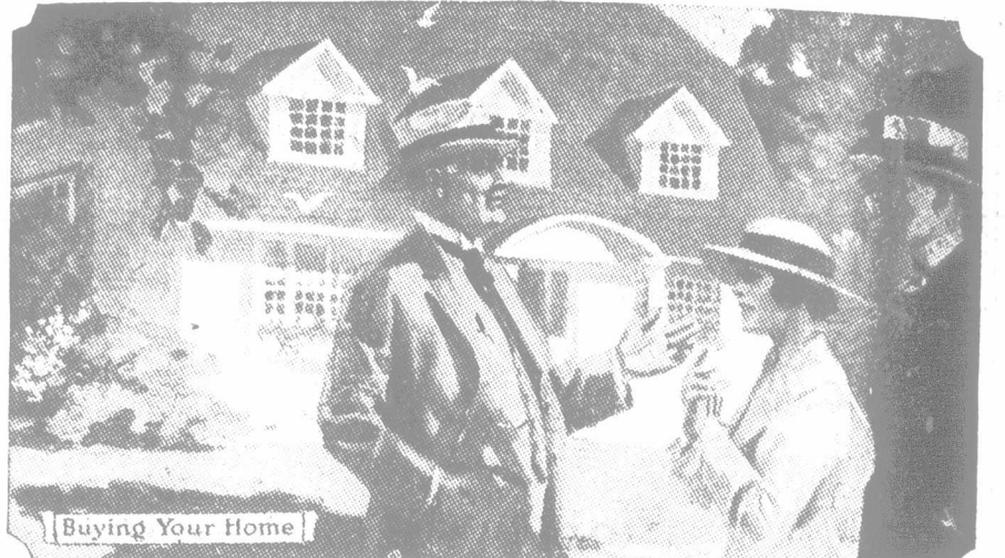
Buying Your Home