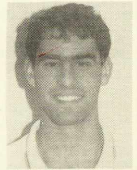
Everett Rose Volleyball