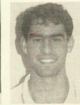
Everett Rose Volleyball