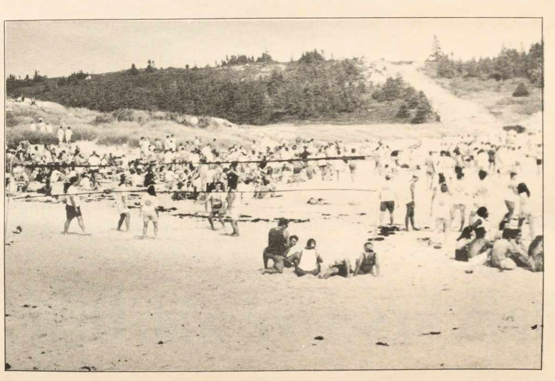
Beach volleyball — one of the best ways to get sand in your mouth, ears, bathing suit...

All good things must come to an end, however, this good thing will end with a real bang. Fireworks at Studley Field will be the grand finale to your week as Frosh and a great launch of your stay at Dal. Lots of luck and have the time of your life!