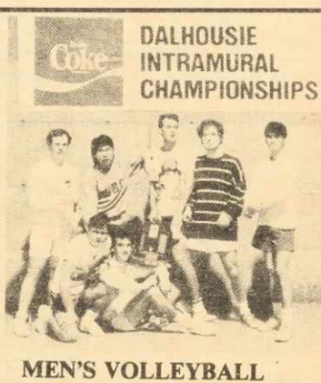
MEN'S VOLLEYBALL "B" CHAMPS Pigdogs