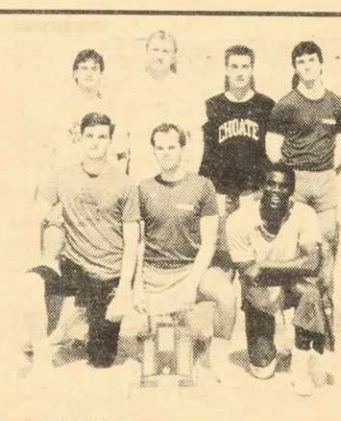
MEN'S VOLLEYBALL "A" CHAMPS COMMERCE