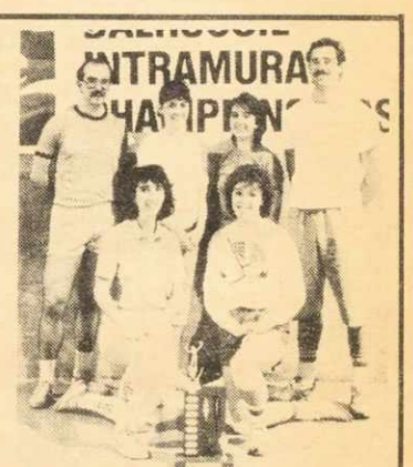
CO-ED VOLLEYBALL "B" CHAMPS OCCUPATIONAL THERAPY

— EUROPE — LONDON — GOING YOUR WAY — EUROPE — LONDON —