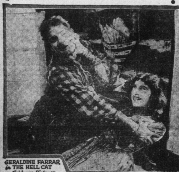
GERALDINE FARRAR in THE HELL CAT Goldwyn Pictures