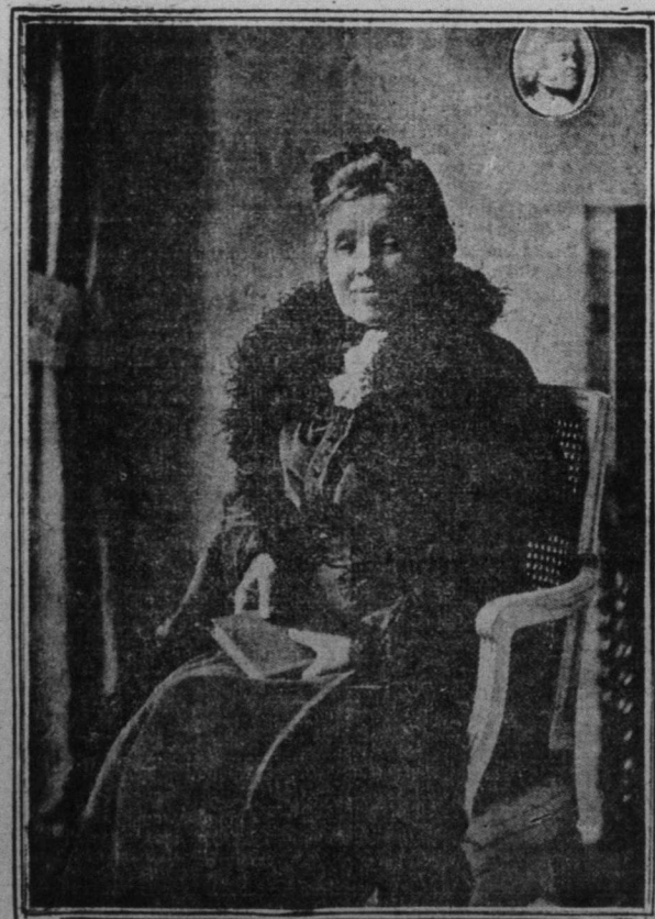
LADY RITCHIE, DAUGHTER OF THACKERAY.

Grand Cavalcade and Pageant, Old Time Costumes, Pow-wow around Camp-fire, Ground Hog Festival with Potato Pancakes, Waffles, Flap Jack, Haggis, Pretzel, Etc. United Choirs of County with Band Accompaniment, Patriotic Addresses. LADIES' DAY—Quilting and Spinning Bee. Bands and Singing Societies of County. Prize for the "BEST GIRL" Horse and Buggy, decorated with ribbons and natural flowers. Bring your Lunch Basket, Cups, Saucers, Tea and Coffee Pots. GOD SAVE THE KING.