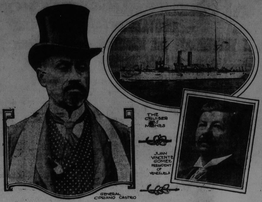
Official Washington was startled when it learned that Castro had eluded the surveillance of American Consuls, who had standing instructions to watch him, slipped into Venezuela and started a revolution against President Gomez.