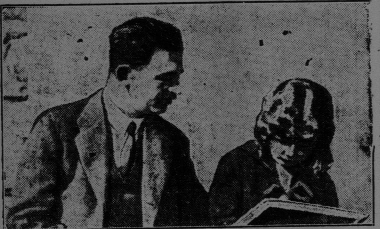
Ex-Emperor Carl is living a quiet life with his children at Prangins, on Lake Geneva, where he is often to be seen with them. Here he is shown teaching his eldest son, Prince Otto, 7 years of age, who may yet become Emperor of Hungary.