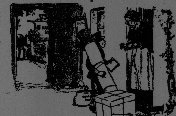
Old Lady: "Run out to the man in the cart and get change." Diminutive War Worker: "I am the man in the cart!" —London Opinion.

Well, if this is so, then we suppose when the war is over and the soldiers are back from the front, the brewers and distillers should welcome a plebiscite to show how the majority of Canadians love the traffic. But the trade knows as well as we know that the country is against the traffic, and will vote against it at every opportunity. And our own Canadian brewers and distillers are discreetly silent in regard to the number of men they have sent