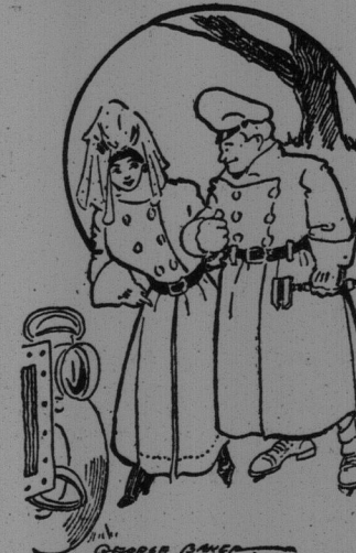
HE WAS OUT.

First Autoist—I was looking for you and your automobile yesterday on the road. Were you out?