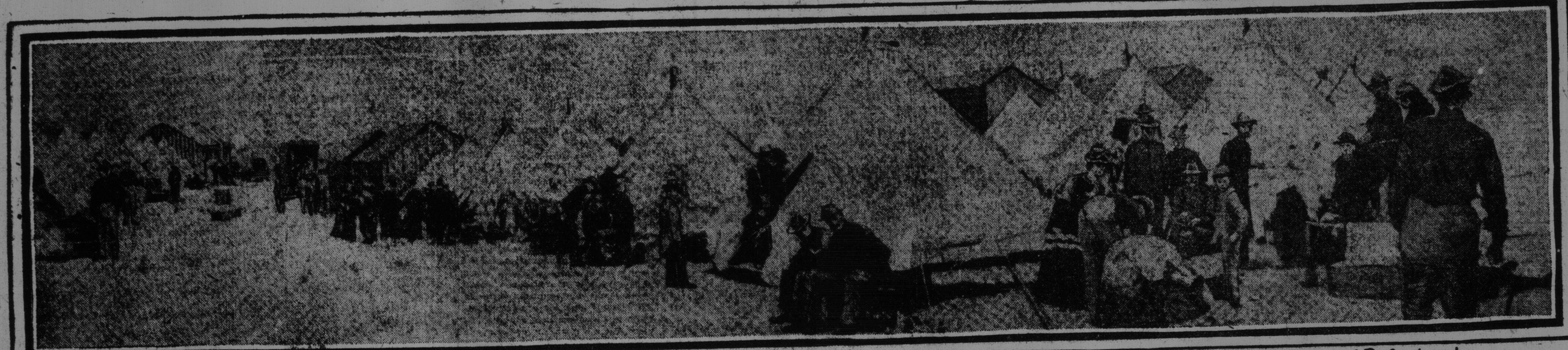
Scene in the Presidio, the U.S. Military Reservation at Jan Francisco, now turned into a great tented camp of Refugees.