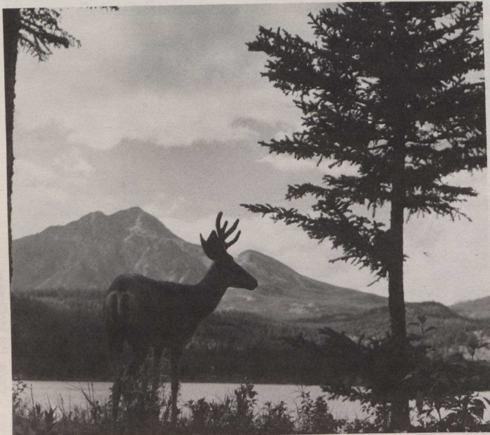
Lake Edith and Pyramid Mountain, in Jasper National Park.