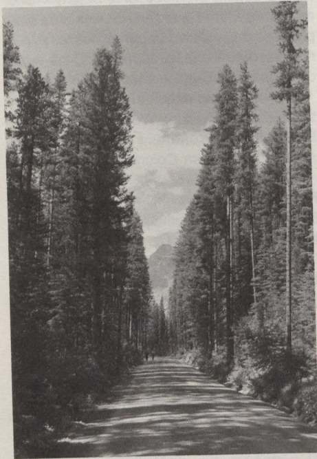
"Snow Peak Avenue" on the road to Emerald Lake in Yoho National Park.

Inside the northern entrance to the park along the Banff-Windermere Highway, are