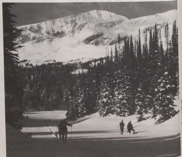
Cross-country skiing on one of the many trails in Banff National Park.